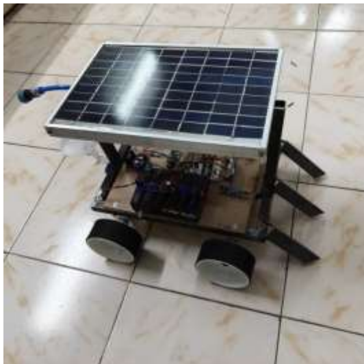
Figure 2: Solar-Powered Agribot Hardware Prototype Result Description

The Solar-Powered Agribot hardware prototype was successfully developed and tested under field-like conditions. The robot consists of a solar panel mounted on the top surface, rechargeable battery, ESP32 controller, geared DC motors, ploughing blades at the front, seed dispensing servo mechanism, water sprinkler system, and IoT communication module. The solar panel continuously charges the onboard battery, enabling sustainable autonomous operation in agricultural fields without dependence on external power sources.