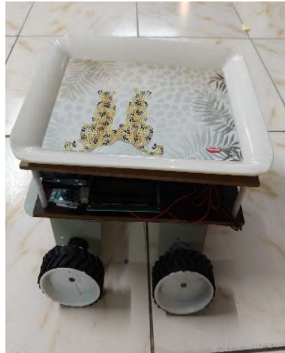
Fig. 3: Final Mobile Robot Platform with Object Carrying Capability

Figure 3 presents the completed robotic vehicle integrated with a carrying platform for transporting small objects. The robot responds to voice commands transmitted through Bluetooth and performs movement operations accordingly. A tray mounted on the robot allows it to carry lightweight materials, making it suitable for assistance applications in homes, hospitals, offices, and industrial environments. Experimental testing confirmed smooth movement, accurate command execution, and stable wireless communication.