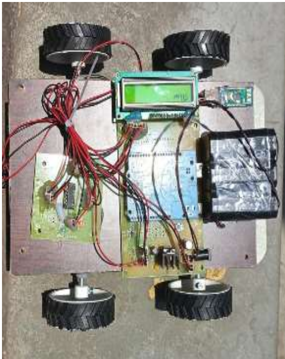
Fig. 2: Developed Hardware Prototype of Bluetooth Voice Controlled Robot

Figure 2 shows the developed Bluetooth-Controlled Voice Assistance Robot prototype. The robot consists of an Arduino microcontroller, HC-05 Bluetooth communication module, L293D motor driver circuit, rechargeable battery pack, 16x2 LCD display, and a four-wheel drive mechanism. The Bluetooth module receives voice commands from a smartphone application and transmits them to the controller for processing. Based on the