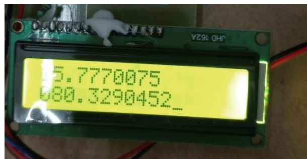
Figure 2. Real-Time GPS Location Tracking and Map Visualization of the Proposed System

Figure 2 illustrates the real-time location tracking functionality of the proposed ESP32-based biometric monitoring and tracking system. The GPS module continuously acquires geographic coordinates, which are displayed on the 16×2 LCD interface and transmitted to the monitoring platform. The obtained latitude and longitude values are visualized on Google Maps, enabling accurate tracking of the user's current location. The displayed map confirms successful communication between the embedded device and the location monitoring application. Experimental results demonstrate that the system can reliably capture, process, and present real-time positioning information, thereby enhancing user safety, remote monitoring, and emergency response capabilities.