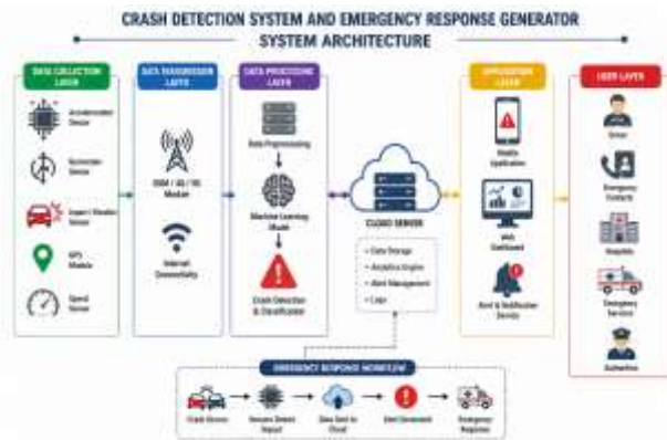
Fig.1. System Architecture of Crash Detection system

Finally, the emergency services respond to the alert and provide assistance. This flow ensures quick detection, accurate decision-making, and timely emergency response, significantly reducing delays and improving road safety outcomes.